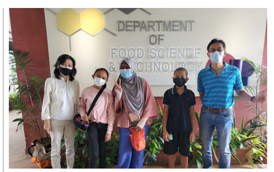
Kids from the Children's Wishing Well went on an educational tour at the NUS Department of Food Science & Technology during the NUS annual Day of Service. (Top and Below)

Volunteers handing out care packages to beneficiaries from Dover Park Hospice during the NUS annual Day of Service.