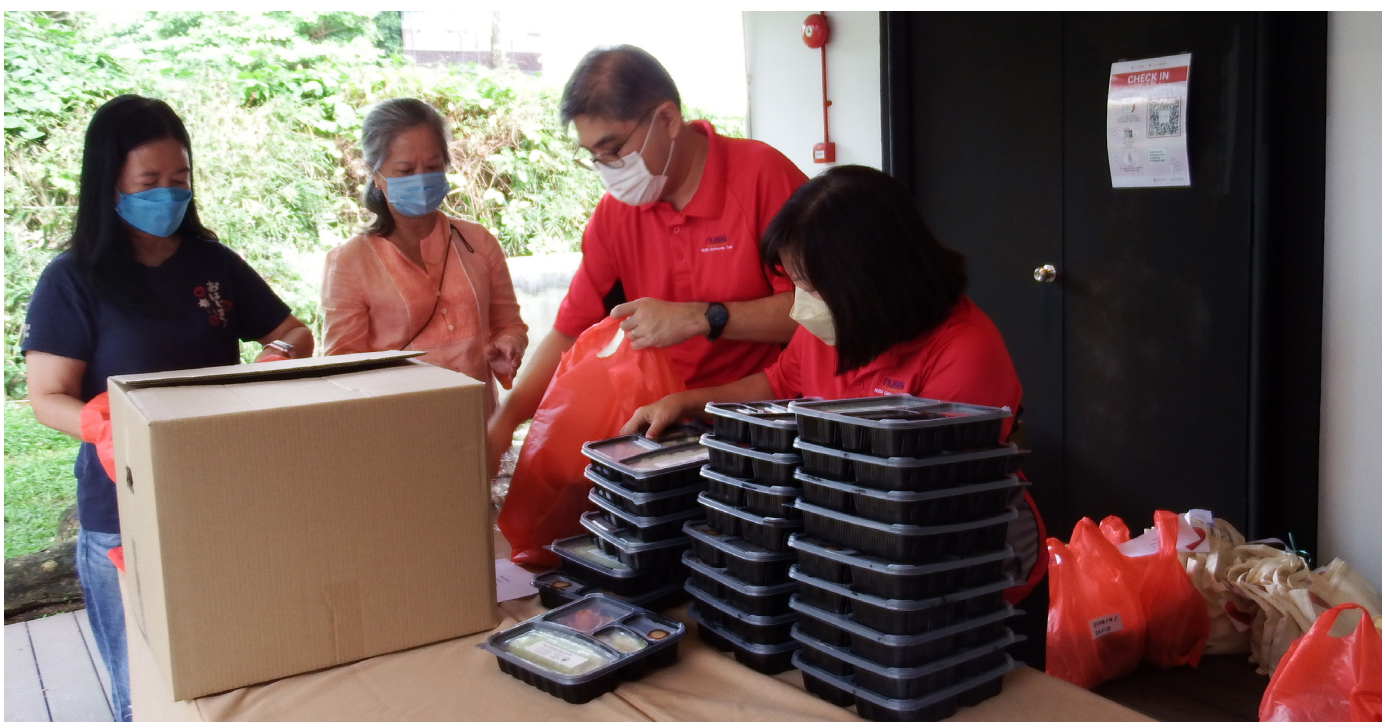
Volunteers at Mandalay Guild House assembling care packages during the NUS annual Day of Service.

he Society has always placed community at its core with one of its missions to promote a more gracious social and cultural environment.